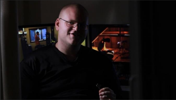
WINNER BEST OVERALL & AUDIENCE CHOICE FIVE TOWNS COLLEGE 72 HOUR FILM FESTIVAL