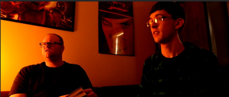
NOMINATED FOR BEST SCREENPLAY AT THE 1 ST SOL NEGRIN AWARDS