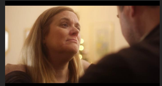
WINNER AUDIENCE CHOICE AWARD AT THE 1 ST SOL NEGRIN AWARDS