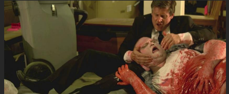
WINNER BEST 3 RD YEAR FILM & AUDIENCE CHOICE AT THE LUMINARY AWARDS (2017)