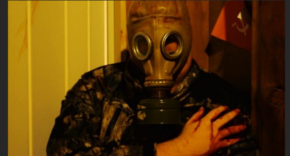
NOMINATED BEST 1 ST YEAR DIRECTOR AT THE LUMINARY AWARDS (2014)